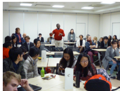
HUSA international exchange students getting feedback

The seminar was held by inviting the examiners from local industry and city council and received an important feedback. Professors and graduate students of Hiroshima University also attended the seminar, and students received valuable feedback on their project for its actualization.