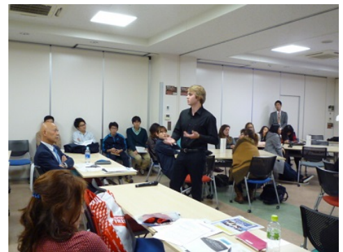
HUSA Program Students in Q&A Session