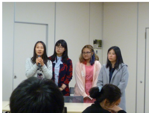
HUSA international exchange students conducting a presentation

The seminar was held by inviting the examiners from local industry and city council and received an important feedback. Professors and graduate students of Hiroshima University also attended the seminar, and students received valuable feedback. We are looking forward to further progress in the final seminar in July where the students will present the final result of their project achievement.