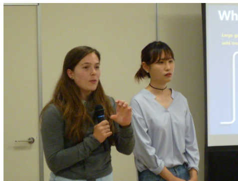
HUSA international exchange students conducting a presentation

The seminar was held by inviting the examiners from local industry and city council and received valuable feedback. Professors, graduate students, and research students of Hiroshima University also supported the seminar. Participants were impressed with the international students' great efforts and their final products such as a beautiful recipe booklet and Hiroshima dialect leaflet. The project results will be fully utilized for international students coming to Hiroshima University.