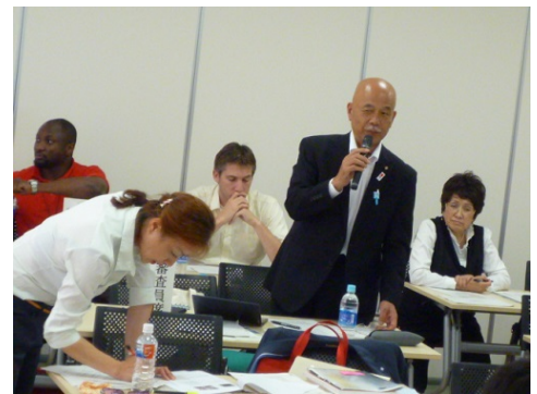
Getting Feedback from Examiners