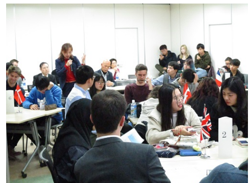
HUSA international exchange students getting feedback

Hiroshima University Study Abroad Program (HUSA)