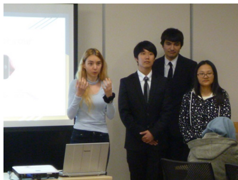
HUSA Program Students Making a Presentation

Currently, projects such as "30 Days Survival Guide," "Hiroshima University Preparation Guidebook for New International Students," "An Introductory Video about Higashi-hiroshima," "Saijo Town Guide," and "Creation of an Interactive Map of International Cuisine in Saijo," have been taking place to provide support for international students from global perspectives. We are looking forward to the development of the students' new projects.