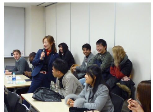
Students Giving Feedback for Projects

Hiroshima University Study Abroad Program (HUSA)