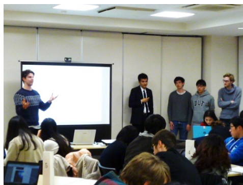
HUSA Program Students Making a Presentation

Currently, students are working on projects such as "30 Days Survival Guide," "Hiroshima University Preparation Guidebook for New International Students," "An Introductory Video about Higashi-hiroshima," "Hirodai Circles & Clubs," and "Creation of an Interactive Map of International Cuisine in Saijo." Students are going through the process of trial and error. We are looking forward to seeing how the projects will progress.