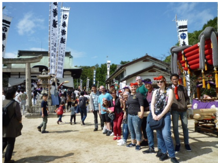
Experiencing the traditional Japanese matsuri (festival)

Local people warmly welcomed international students from all over the world who visited the traditional Japanese festival. When students got off the bus, "bakurô" was waiting for the students. Students also experienced wearing "hachimaki (a cloth headband)" that local people prepared for them. This day became a very memorable and enjoyable day enjoying the tradition in Japan.