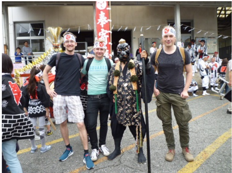
With "tengu" in the festival