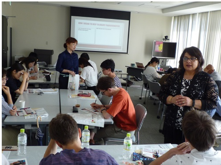
Intercultural Competence & Transformative Collaboration Session

We had participants from local administrative offices, local industry, and local schools. Professors, graduate students, international students, and Japanese students of Hiroshima University also attended the seminar, and this became a precious opportunity to examine together diversity and inclusion in global society, university, and local society. There was a voice, "This has become my life-changing experience. I have started seeing my future from a new perspective," "I now see the value of experiential learning that locate students in uncertain situations where they need to seek answers by themselves." Participants have had a very stimulating and fresh experience to see inclusion and diversity in a new light.