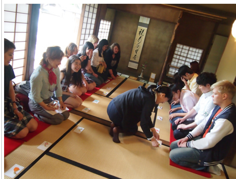
Tea ceremony experience at Hakusetsurou (Kamikamagari Island)