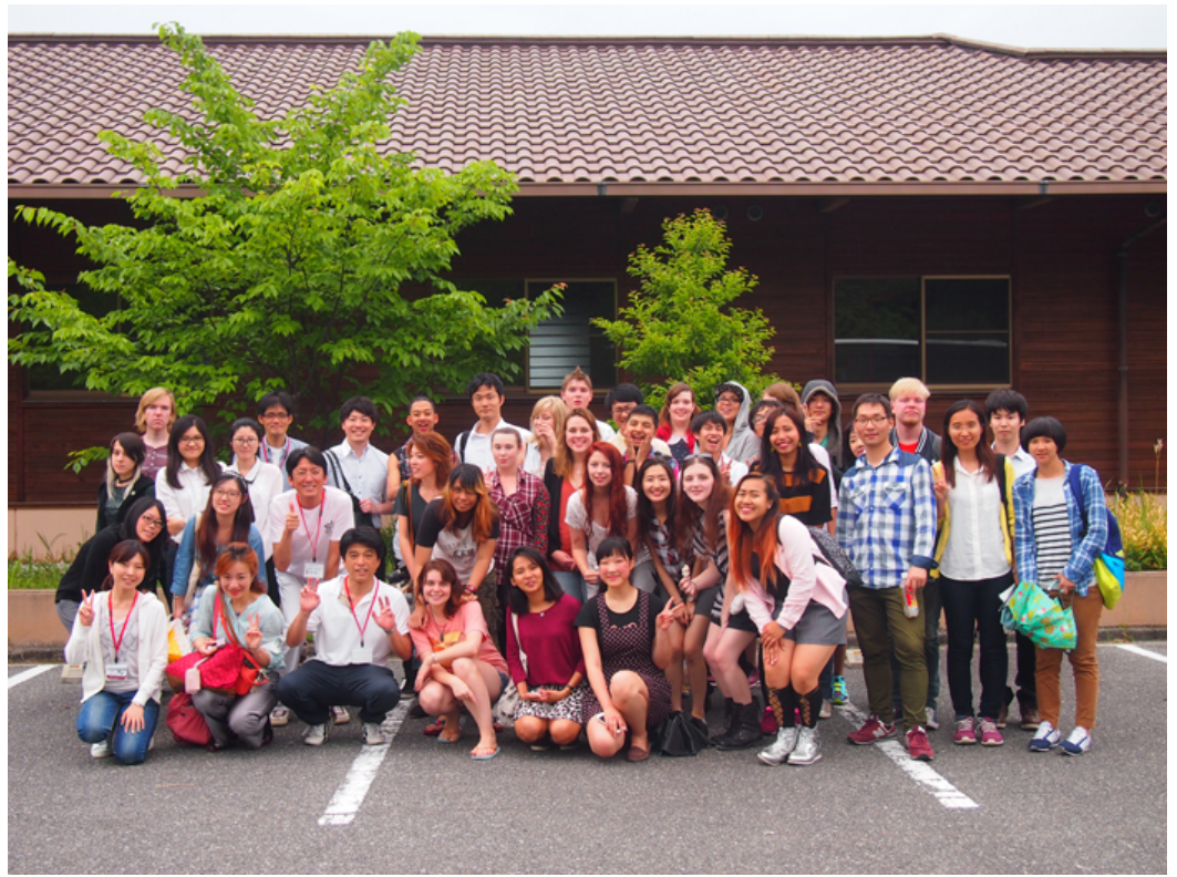
Photograph in front of the "Kagayaki no kan" at the Hiroshima Prefectural Beach (Kamikamagari Island)