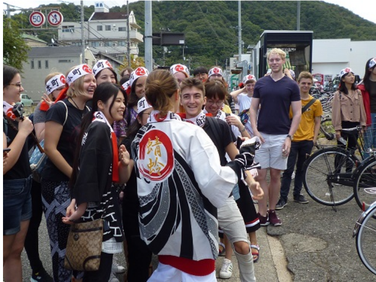
International Students with Community Residents