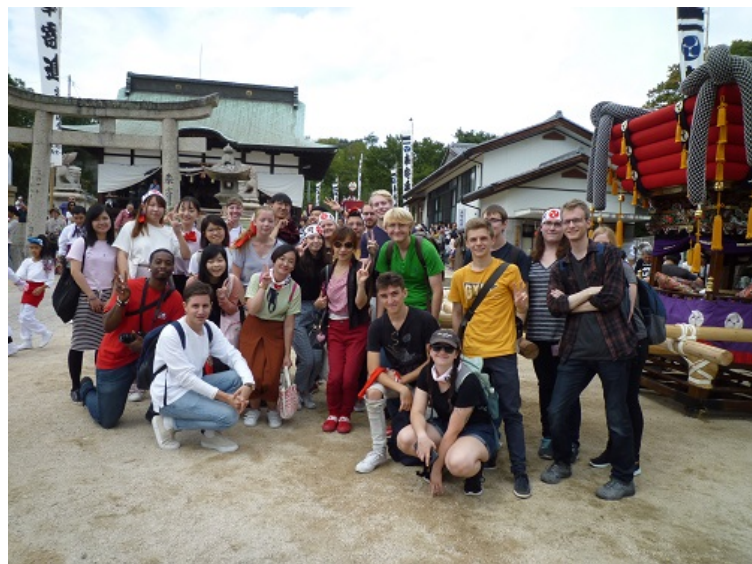
Experiencing the Traditional Japanese Matsuri (Festival)

Local people warmly welcomed international students from all over the world who visited the traditional Japanese festival. When students got off the bus, "bakurô" was waiting for the students. Students also experienced wearing "hachimaki (a cloth headband)" that local people prepared for them. This day became a very memorable and enjoyable day enjoying the tradition in Japan.