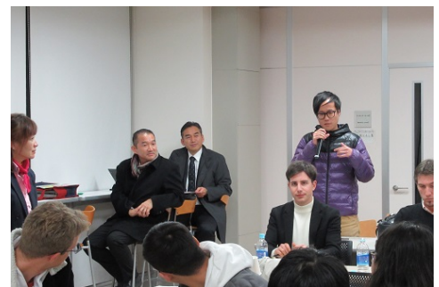
Graduate Student Giving Feedback