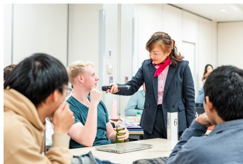
HUSA Program Student Answering Question on their Presentation

HUSA students taking the "Globalization Support Internship" conducted a presentation, taking the lead, on the progress of their international exchange project in Kurahashi Festival coming up in February 2020. This year's seminar has observed active participation of students on campus. We are looking forward to seeing how the projects will progress.