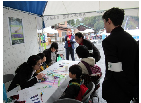
Intern Students Working in the International Exchange Practicum in the Tent