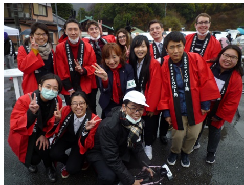
Intern Students of HUSA Program & Volunteer Supporters

On the festival stage, the international students performed a short skit entitled "Foreigners' Difficulty in Learning Japanese", followed by a music and dance performance. The interns' practicum has been progressing year by year. To close the festival, students experienced Mochimaki (rice cake throwing). As the local community warmly supports the international students, the bond between them is becoming stronger each year.