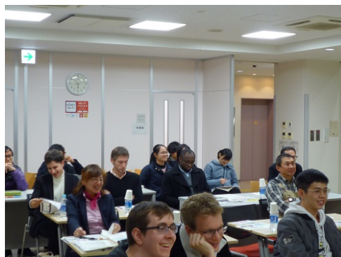
Students in the Glocal Leadership Seminar (Taken in 2019 December)

The seminar was held as open seminar and students received valuable feedback from people from professors, graduate students, international students and Japanese students of Hiroshima University, and municipal government officials. Students gained insights into how they could cooperate with local people. The project results will be reported on the HUSA Program homepage for open access.