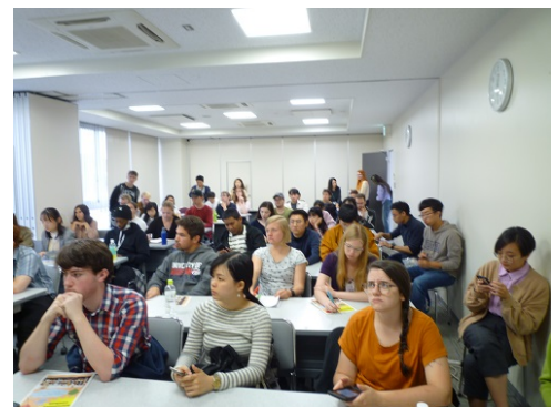
HUSA Program Students Attended the Project Meeting (Taken in 2019 October)

Official website of the Hiroshima University Study Abroad Program