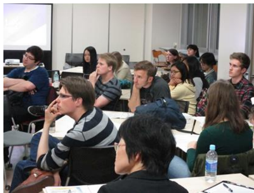
HUSA international exchange students in the seminar

Currently, HUSA international students are fully utilizing their creativity and practical skills in various projects: development of the interactive method to introduce foreign cultures to children, introducing the celebration events of various countries, and English education method via music. It is expected that their learning outcome in the seminar will further help students to develop and complete the group project.