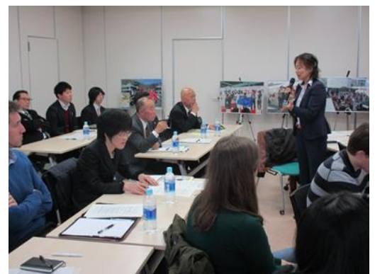
Getting feedback from the local officials