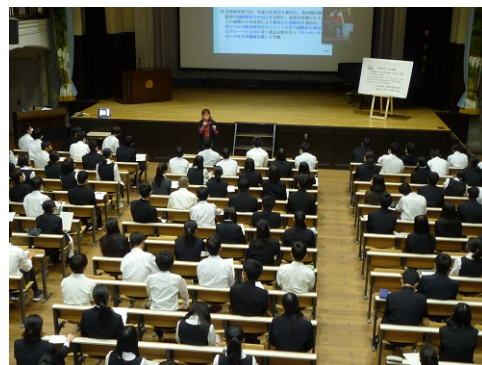
Frontier Science Lecture