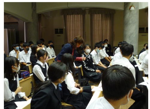
Interacting with High School Students