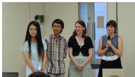
HUSA international exchange students giving a presentation

Achievement of the projects has become an asset in students’ study abroad experience. Students will fully utilize their study abroad experiences in Japan for one year and make great endeavors in the future.