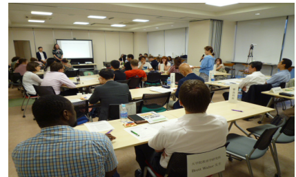
Actively discussing the learning from the project